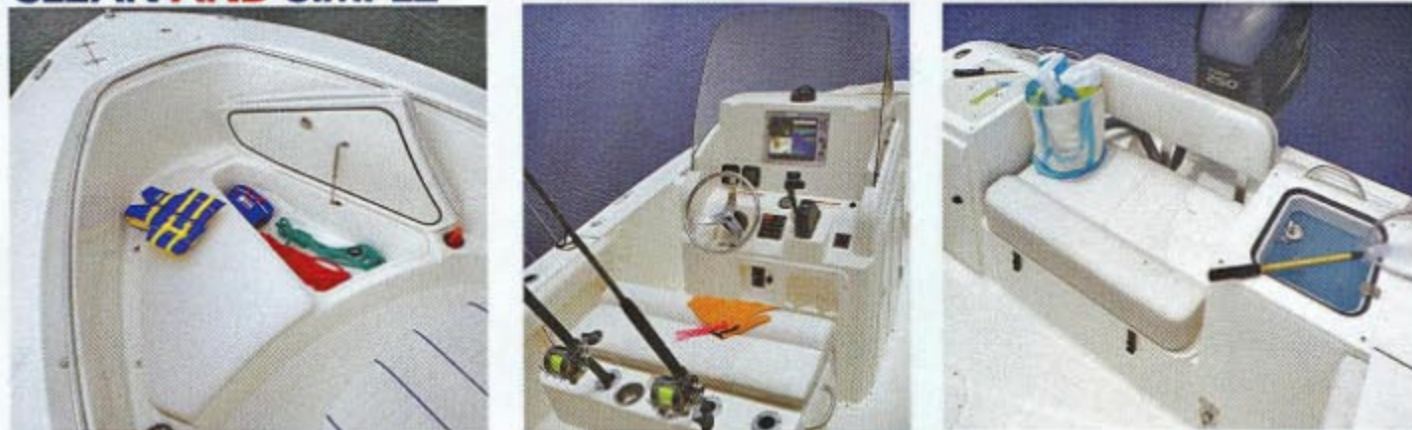
The C230 has a large casting platform forward (left), a compact and functional console (center) and a very practical transom (right).

Well known for building a stout, well-rigged and engineered boat, the folks at Pursuit Boats continue to turn out products that fill a niche for their loyal owners as well as entice new owners into the fold. With solid design and construction practices entrenched in the culture at the sprawling Ft. Pierce, Florida facility, Pursuit is building a line of boats with fine styling and always packed with features.