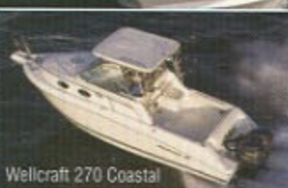
Wellcraft 270 Coastal

PRESORTED STANDARD US POSTAGE PAID DETROIT, MI PERMIT No. 2217