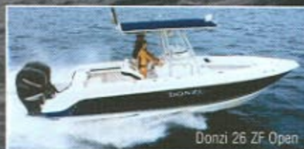
Donzi 26 ZF Open