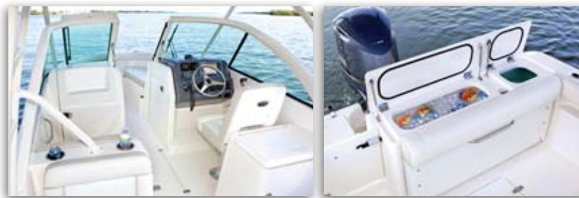
The dual helm is roomy; the enclosed and plumbed head is behind the port console. The windshield panel and a door hinged over the helm storage combine to close the walkthrough space. That's a live baitwell on the port side of the transom-mounted fish box. The handle in front opens a fold-down seat.

L.O.A: 25' 10" (w/pulpit) Beam: 8' 9" Hull Draft: 21" (motor up) Hull Draft: 37" (motor down) Average Dry Weight: 5,875 lbs (w/single 350 engine) Max. Horsepower: 350hp (single engine) Fuel/Water Capacity: 150/18.5 gals. Range @ 27mph: 320 miles MSRP w/ 1x 350hp Yamaha $112,765