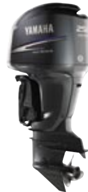
F250TXR / LF250TXR