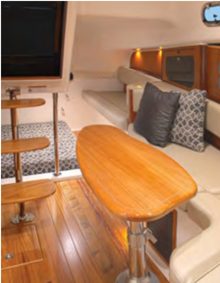
OPTIONAL Interior Arrangement